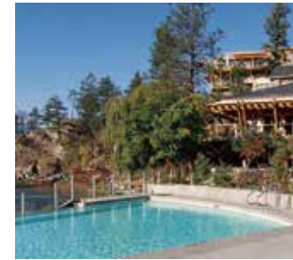
OUTBACK, OKANAGAN LAKE, BC

COME IN AND CHECK OUT OUR NEWLY DESIGNED SHOWROOM.