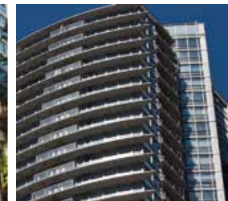
CAPITOL RESIDENCES, VAN, BC