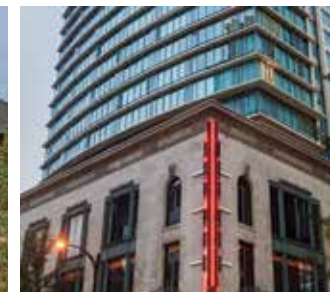
THE HUDSON, VANCOUVER, BC