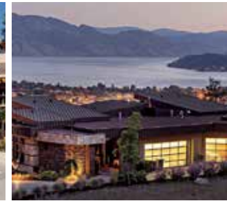
HIGHPOINTE, KELOWNA, BC