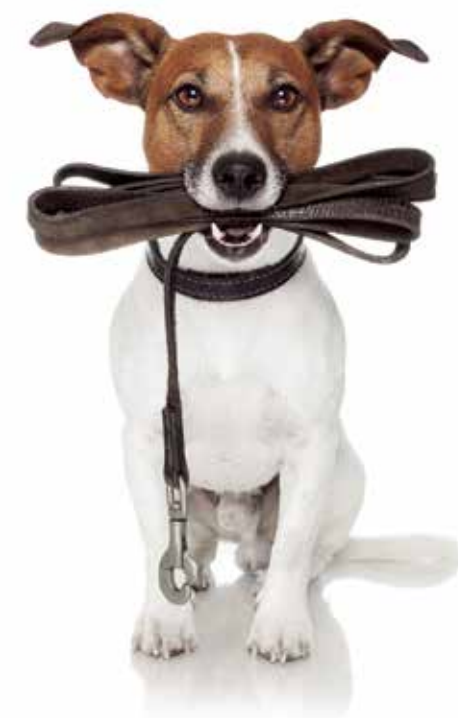
Walking the dog at Lakestone is a pleasure with more than 25km of dog friendly walking trails

CLOSE TO EVERYTHING nearby amenities, wonderful shopping, Lakestone is a great place to live.