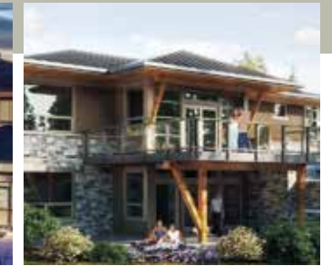
VILLAS AT WATERMARK, CALGARY, AB