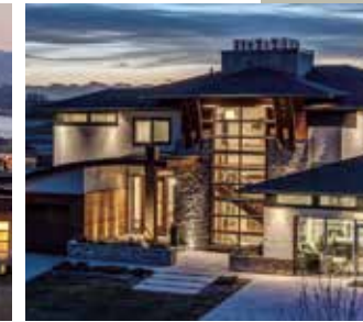
WATERMARK, CALGARY, AB