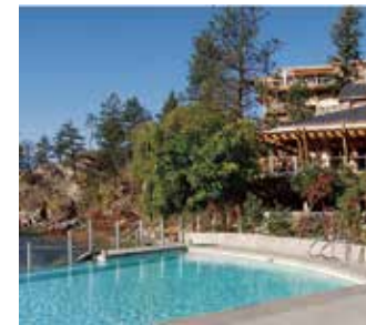
OUTBACK, OKANAGAN LAKE, BC