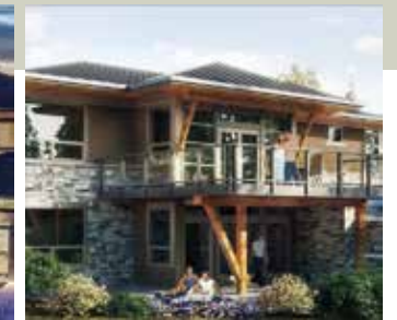
VILLAS AT WATERMARK, CALGARY