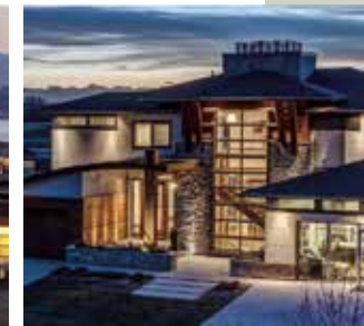
WATERMARK, CALGARY, AB