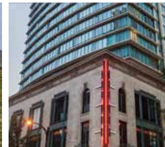
THE HUDSON, VANCOUVER, BC