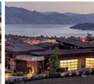
HIGHPOINTE, KELOWNA, BC