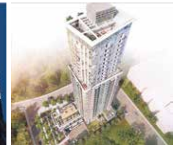
PRIME, SURREY, BC